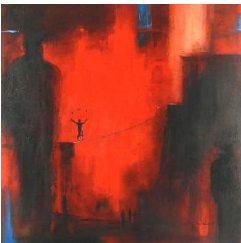
Acrobate rouge 850 eur