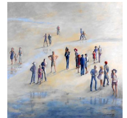
Rendez-vous sur la plage 850 eur