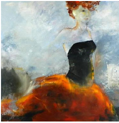
Parfum exotique 850 eur