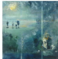
The mentalist 850 eur