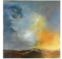
Songe 950 eur