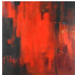
Funambule rouge 2 850 eur