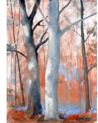
Forêt bleue 650 eur