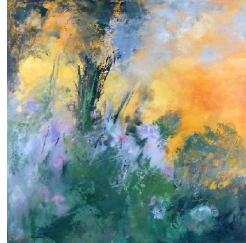
Inspiration nature 850 eur