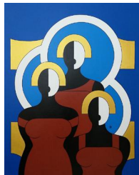
Discographie 950 eur