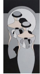
Models 750 eur