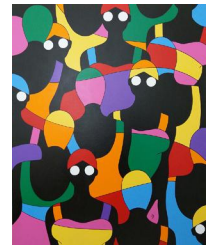
Sous les flots 950 eur