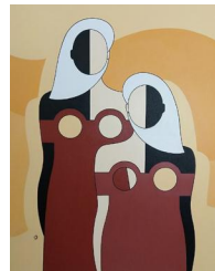
Les Oasiennes 950 eur