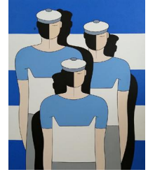
Les matelots 950 eur