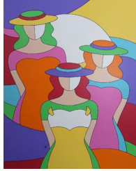
Jardin d'ete 950 eur