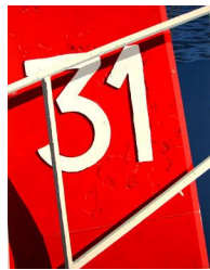
Abeille 31 950 eur