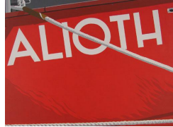
Alioth 950 eur