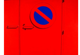
Ne pas garer à Bedouin 950 eur