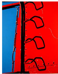
Echelons du Hardi 950 eur