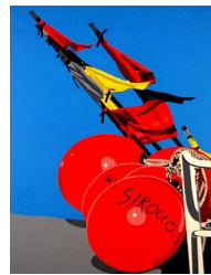
Sirocco 950 eur