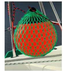
Defense à Boyardville 950 eur