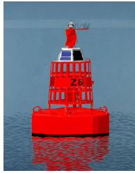
Bouée Z8 950 eur