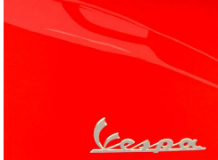
Vespa à Bastia 950 eur