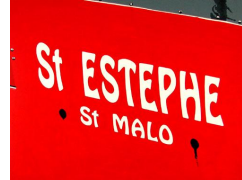
St Estèphe 950 eur