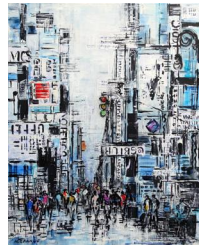
Mélodie en ville 2 650 eur