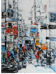
Ville en fête 1 750 eur