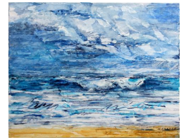
Belle vague 650 eur

BIO: Lives and works in Pyla in south-western France.