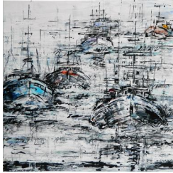
Les chalutiers 2 650 eur