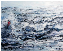
Bouée rouge 800 eur