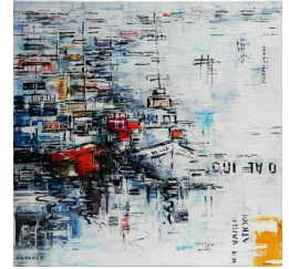
Port de pêche coloré 2 650 eur