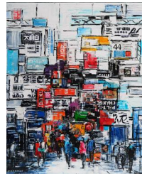
Ville du monde 4 650 eur