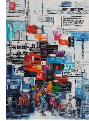
Ville en fête 2 750 eur