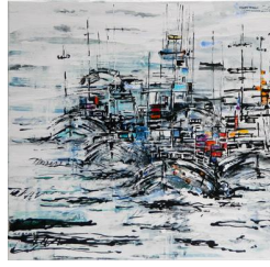
Les chalutiers 4 650 eur