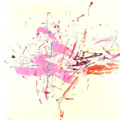
Drop 1 600 eur