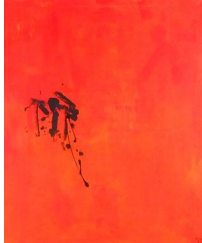
Drop 9 600 eur