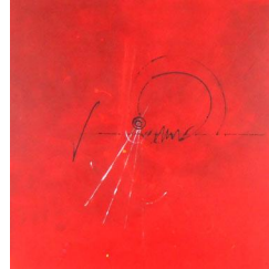
Drop 7 600 eur