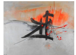
Drop 11 700 eur