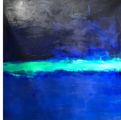
Paysages imaginaires 600 eur