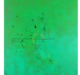
Drop 5 600 eur