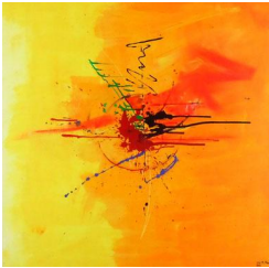
Drop 3 600 eur