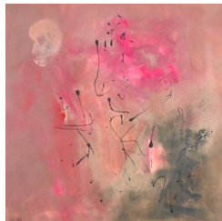
Drop 2 600 eur