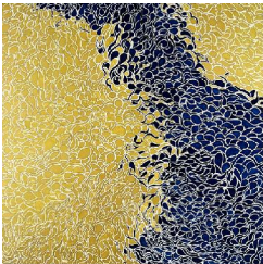
Riviere 650 eur