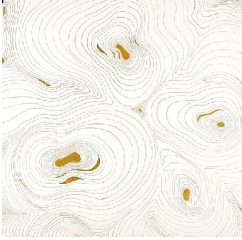
Les collines 650 eur