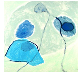
ST4 650 eur