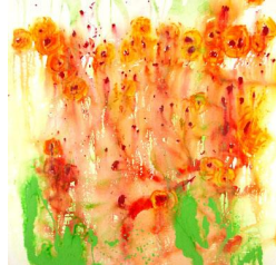
ST7 650 eur