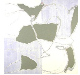
ST10 650 eur