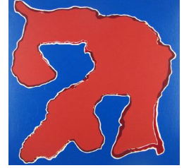
ST5 650 eur