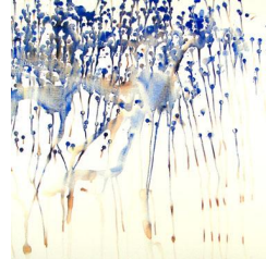
ST6 650 eur