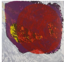
ST8 650 eur