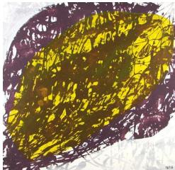
ST1 650 eur