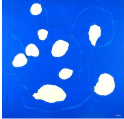
ST9 650 eur